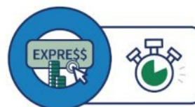
SBA Express Bridge Loans