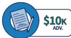
EIDL Loan Advance