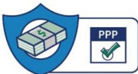
Paycheck Protection Program