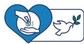
SBA Debt Relief

Any applicants for the EIDL Loan Advance program who did not apply in the new portal with an application number starting with a "2" are being asked to reapply NOW at https://bit.ly/2zm0U57 (in the new portal currently live for agricultural businesses) only in order to update their application and to obtain an application number that starts with a "3".