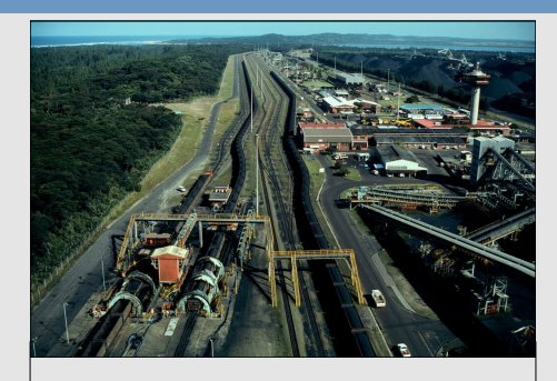
A large coal export terminal in Richards Bay, on the east coast of South Africa.

But on the other side, Bebbington explains, you might see negative impacts to the environment, human health, and economies that once benefited from mining and other extractive activities.