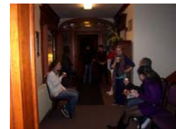
English 184 Poetry Reading